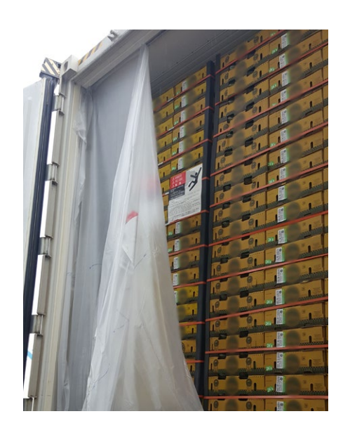
An example of our latest successful work on avocados with our CA in Mexico

and ready to eat' avocados, which command a premium price on the shop shelf.